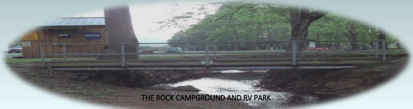
THE ROCK CAMPGROUND AND RV PARK